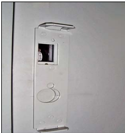
Mounting bracket installed on each switchgear door.