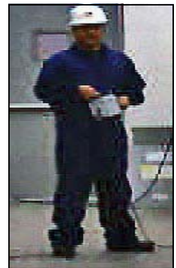
Safe remote operation

For Arc Resistant or standard switchgear.