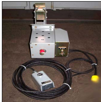
Motor operating kit. May be moved from door to door.