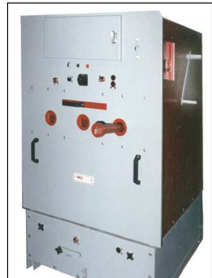
Approved Ground & Test Devices. Ground Studs, etc.

Contact us to help with your specifications and drawings for ConEd Station Service switchgear