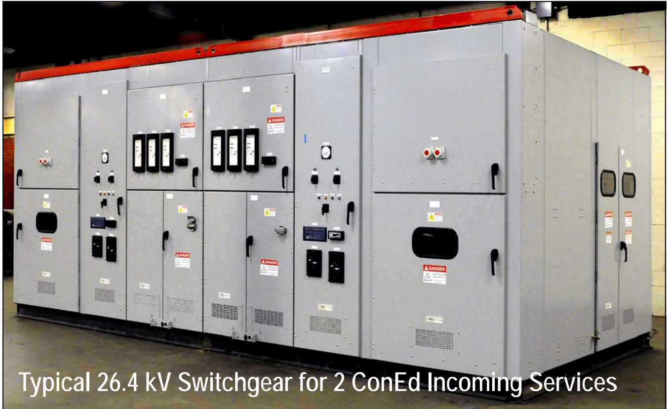
Typical 26.4 kV Switchgear for 2 ConEd Incoming Services